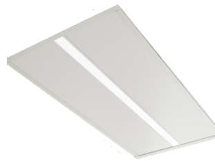
ThinLine with optional Matte White metal 2 x 4 ft troffer extension panels.