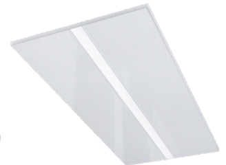
ThinLine with optional Optical White gloss metal 2 x 4 ft troffer extension panels.