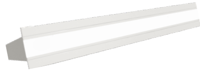
ThinLine for use in acoustic or textured tile ceilings.