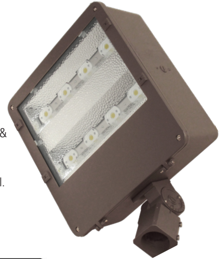
Flood LED shown in Bronze. Die-cast aluminum housing & hinged front frame. 1/2" coin plugs for conduit & photocell.