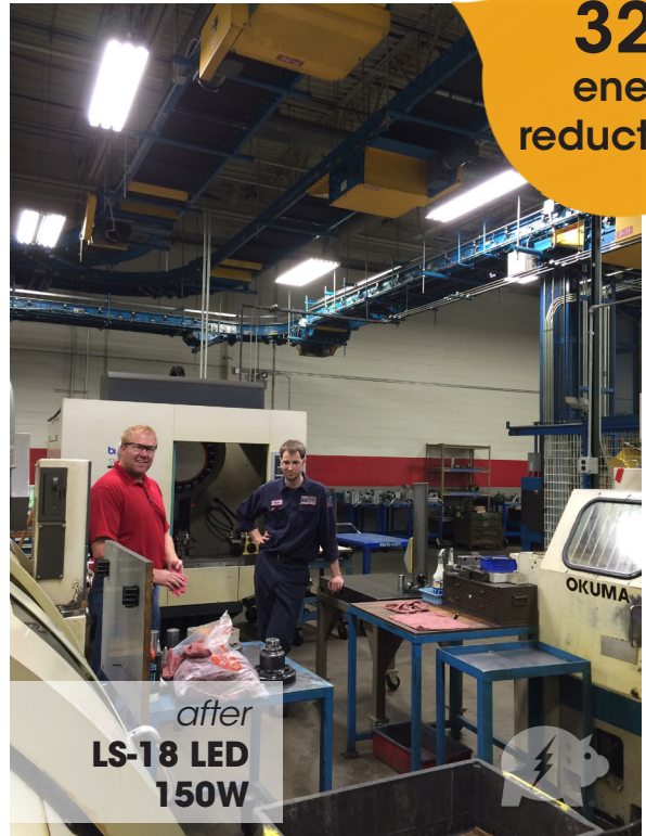
after LS-18 LED 150W