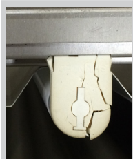
T8 degraded lampholders