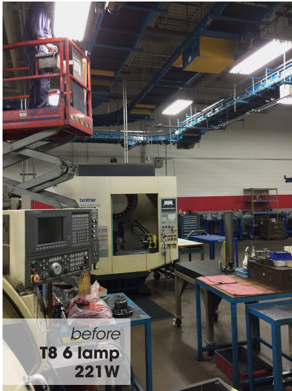
before T8 6 lamp 221W