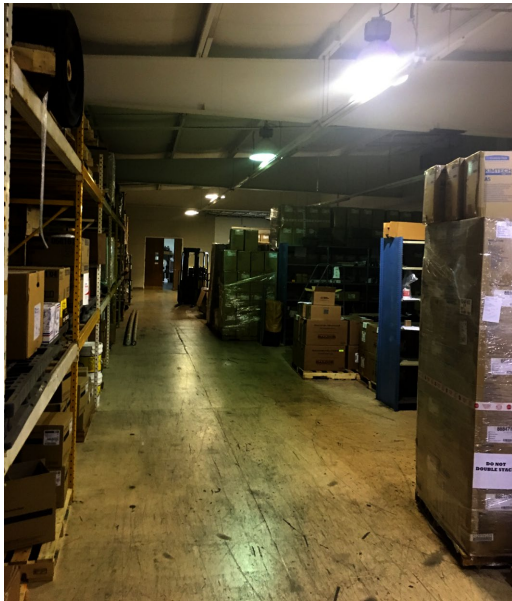
AFTER >50+ FC