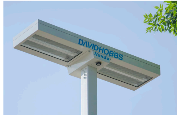
energybank model T exterior LED fixtures

"energybank made everything easy for me," said Hobbs. "They kept it spectacularly simple and that's exactly what I needed to get this job done."