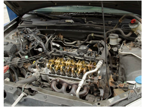
Nearly 100 foot candles on the engine of the car and accurate color make for easy identification of flaws.

Upon check-in we use iPads to take photos of customer vehicles to document any flaws. That dramatically reduced the number of damage claims against our technicians. It also gives us an opportunity to generate new business when we point out those flaws to the owners."