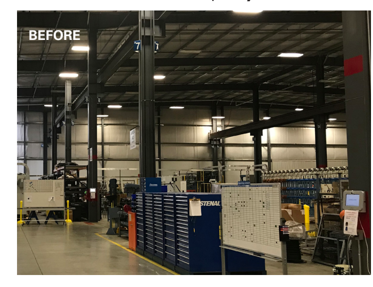
BEFORE 20 foot-candles