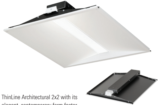
ThinLine Architectural 2x2 with its elegant, contemporary form factor designed for easy installation into 2x2 grid ceilings.