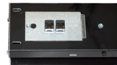
RJ45 Connecting Plate