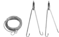
10 ft. Hanging Cable