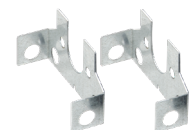
Conduit Mounting Brackets