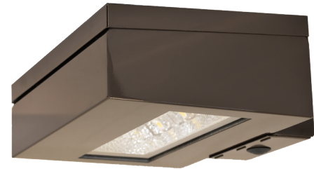
Wall Pack LED shown in Bronze.

Reduce wattage by up to 80%. The LED Wall Pack is a perfect complement to the model T® exterior fixture. Using our patent-pending advanced light engine technology and proprietary optics you will get both 100,000 hour life and exceptional illumination. With its powder coat exterior finish, it will deliver years of trouble free service. Light quality and housing color match the model T perfectly. Fast, easy-to-install design.