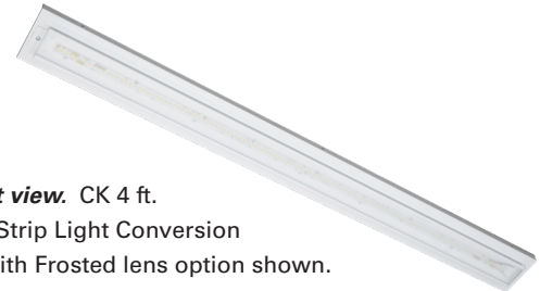
Front view. CK 4 ft. LED Strip Light Conversion Kit with Frosted lens option shown.