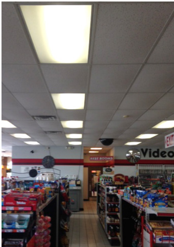
AFTER ThinLine LED 30W